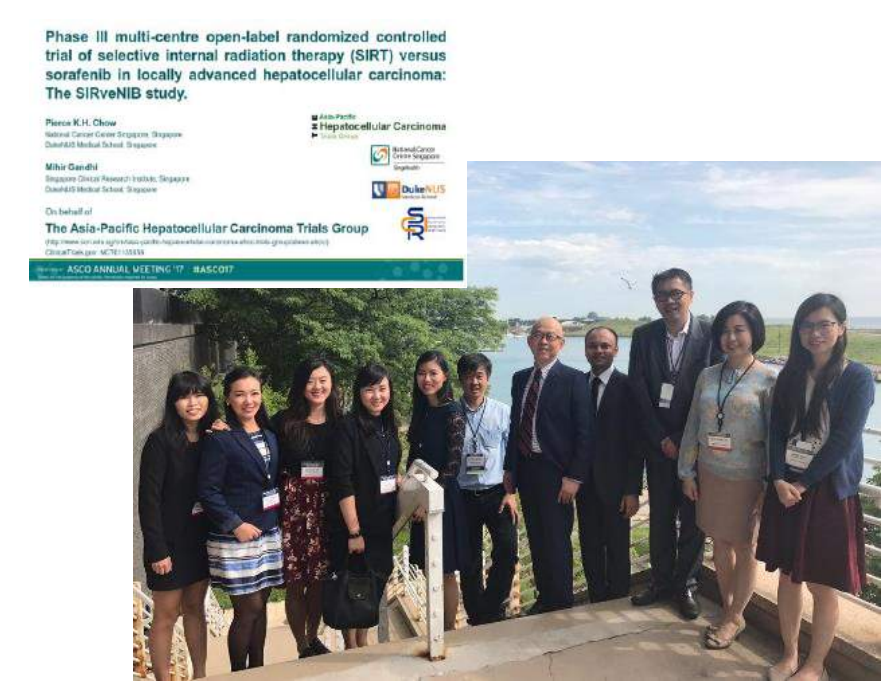
AHCC06 study team members and collaborators at the ASCO Annual Meeting in Chicago.

Thanks to the dedication and hard work to all the study team members inclusive of all the overseas study teams, this achievement will be impossible with their contributions.