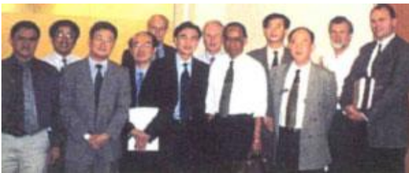
The 2 nd AHCC Trials Group General Meeting in November 2000

The secretariat of the AHCC trials group is supported by the National Cancer Centre Singapore and the Millennium Foundation.